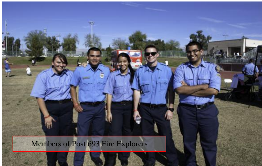
Members of Post 693 Fire Explorers

Along with their regular training the explorer post has been preparing to compete in the City of Murrieta Fire Explorer Muster, taking place on April 19th. This will be our fifth year competing. The Explorers will compete in four different events; the bucket brigade, the two minute drill, the dummy drag and the make and break hose drills.