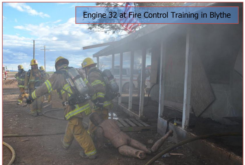
Engine 32 at Fire Control Training in Blythe