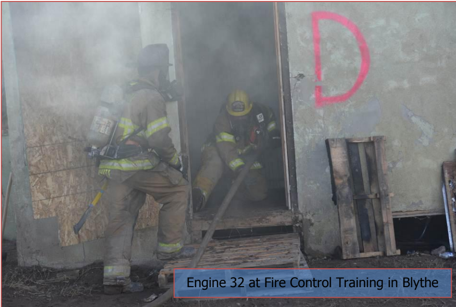
Engine 32 at Fire Control Training in Blythe

On March 24 th Station 32 hosted a fire station tour to 90 preschool children