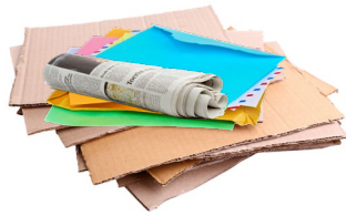
Paper & Cardboard (flattened)