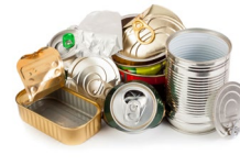
Aluminum & Tin Cans