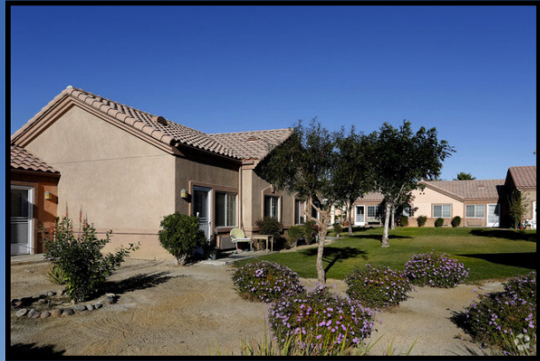
Senior Affordable Housing Apartments: Hadley Villas