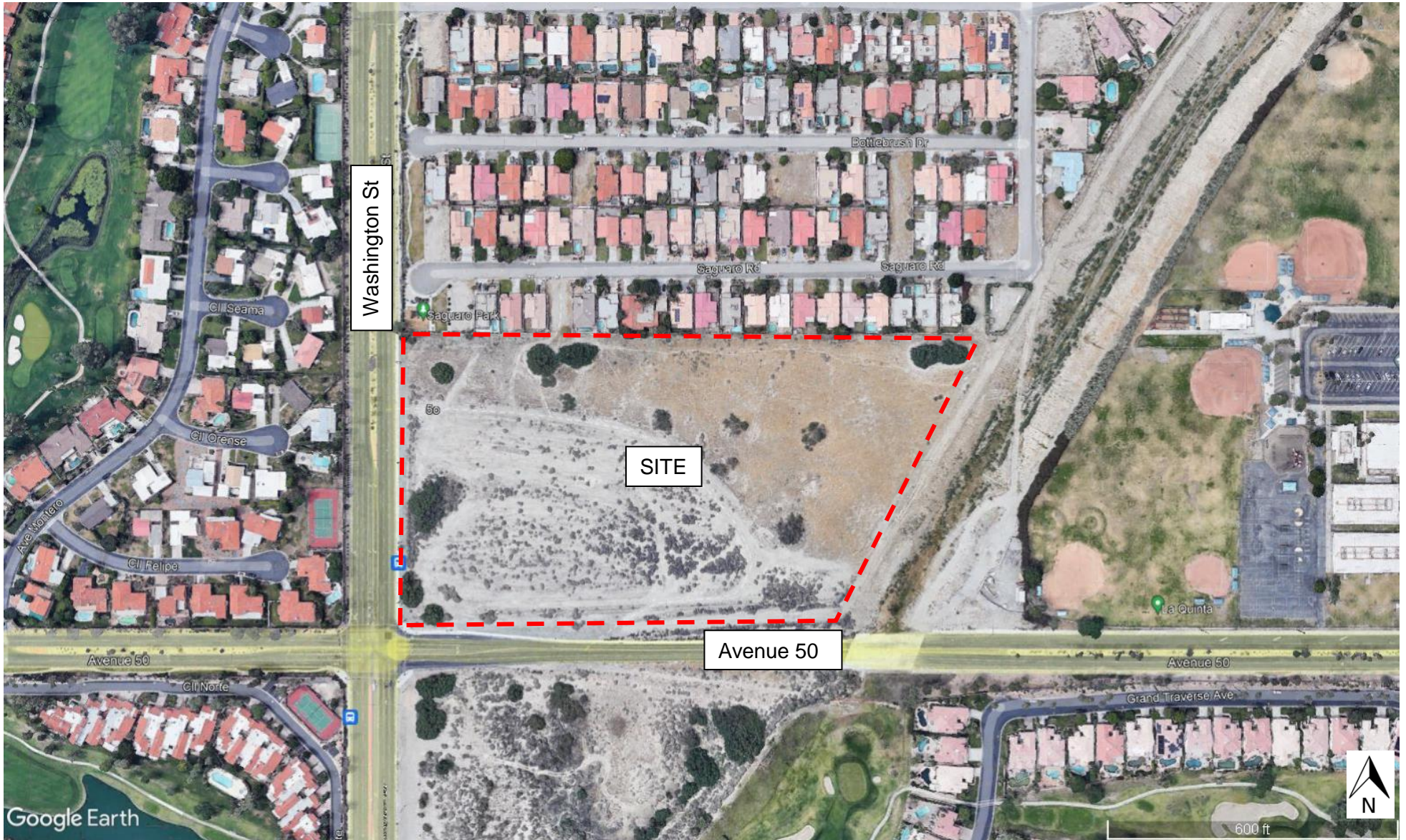
Exhibit A Location Map