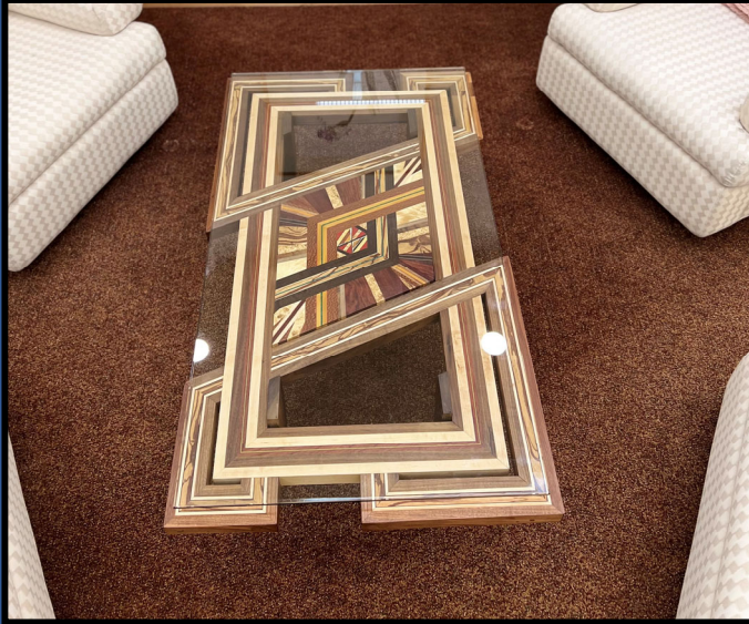
Les Powers “Geometric Table #2”