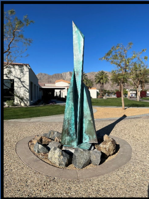
La Quinta's Harmony