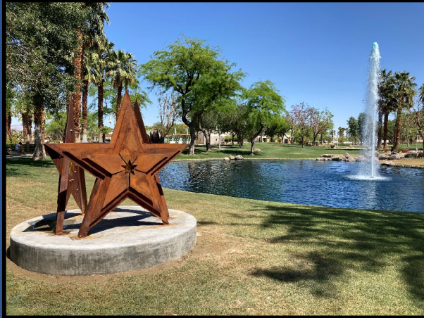
Gold Star Family Monument