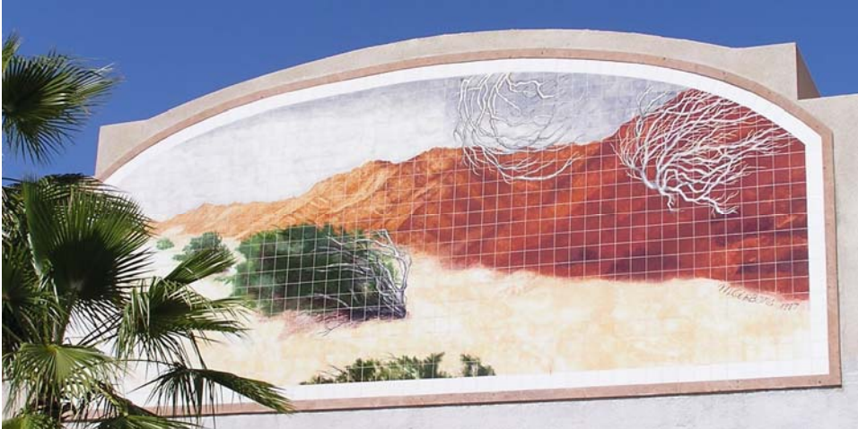
"Mural at La Quinta Car Wash"

Local developers have the opportunity to integrate public art into or adjacent to their residential or commercial projects. Since the inception of the program developers have worked with the City to integrate placement of public art in public right-of-ways for the public to view and enjoy. In this process the developer works in conjunction with the City to bring forth an artist that would complement the new development. The developer then could request fee credits to purchase the APP or the APP program could fund the artwork up to the cost of the fees paid by the developer. Either way this allows public art to be placed throughout the community and add artistic elements to new development.