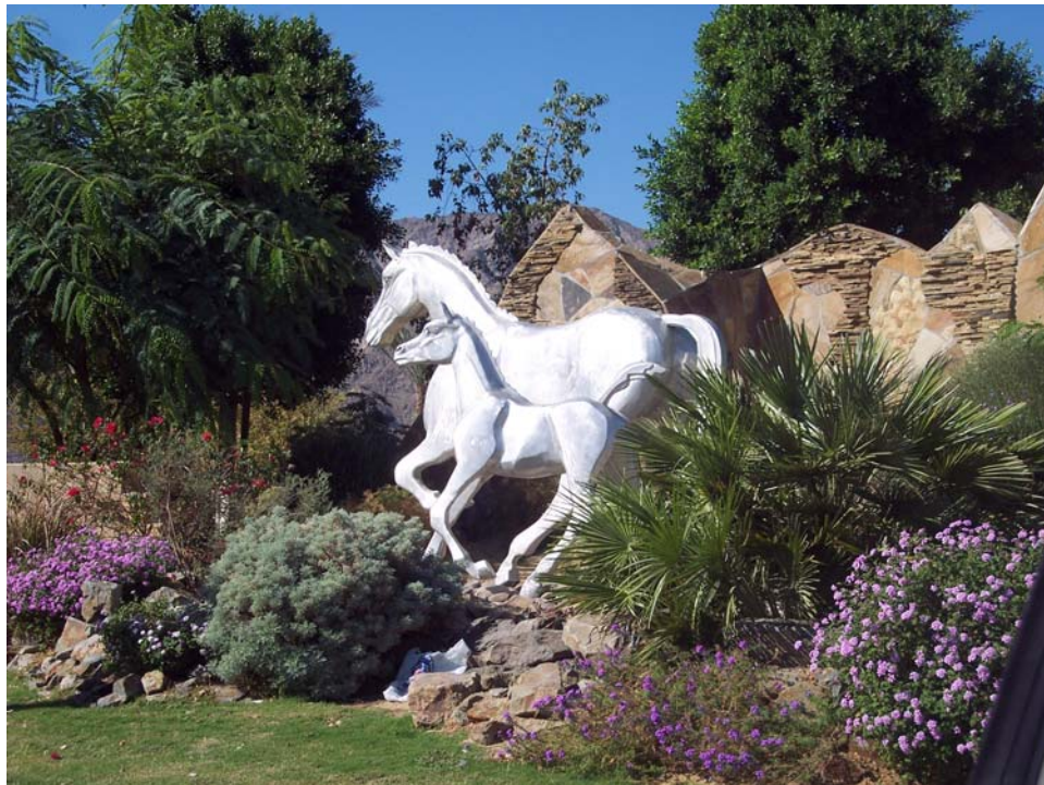
"Horses Running Free"