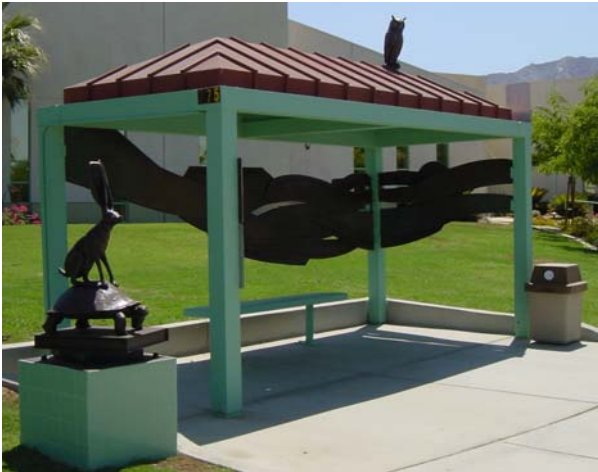
"Library Bus Stop"

The majority of the public art pieces that are located on city owned properties have been acquired through a competitive selection process. A request for proposals is distributed through public art resources to reach artists. The proposals and renderings are then provided to the Community Services Commission which reviews the proposals and interviews the artists. The Community Services Commission makes a recommendation for an artist(s) to be sent to the City Council for consideration and approval. If approved, the artist(s) is then placed under contract with the City to create the art piece.