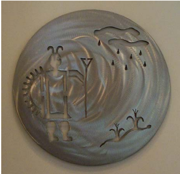
"Garden of Anazasi"