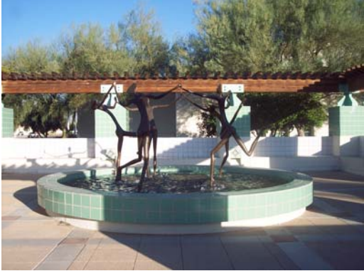
"The Spirit of La Quinta"