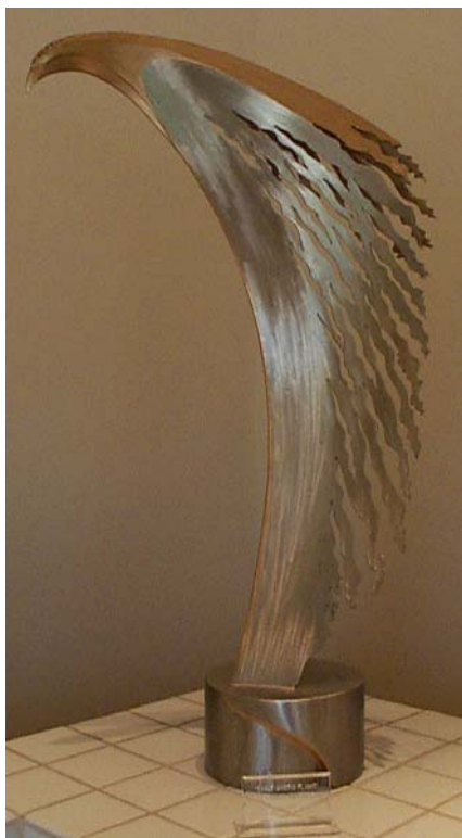
"Eagle Mystic Flight"